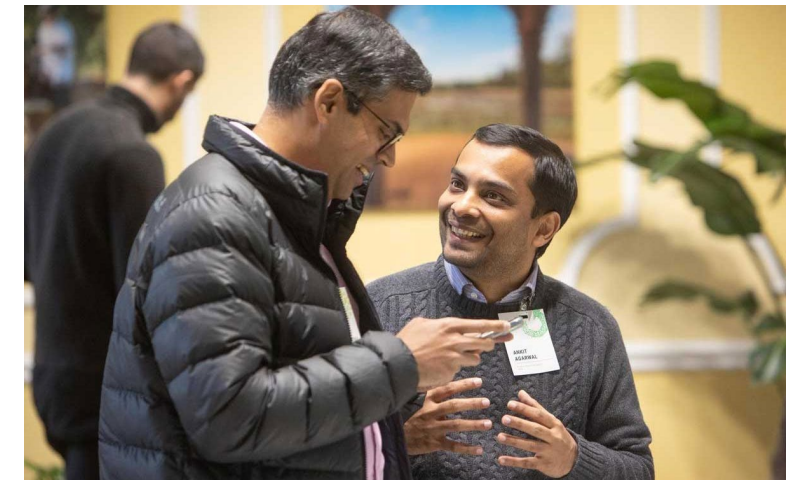
2022 FINALISTS AT THE FELLOWSHIP RETREAT, JAN 2023